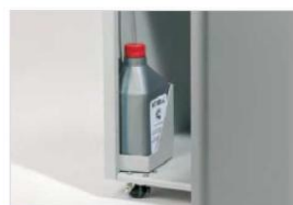
INTEGRATED AUTOMATIC OILING SYSTEM

Heavy duty chain drive with steel gears which offer reliability and resistance to wear.