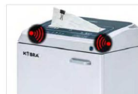
METAL DETECTION SYSTEM SHRED GUARD

The Shred Guard System stops the machine when large metal objects are accidentally inserted. An illuminated optical indicator warns the operator to remove these objects in order to protect the knives.