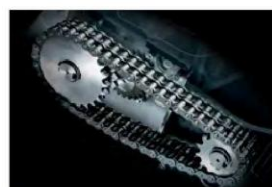
SUPER POTENTIAL POWER SYSTEM

Shows the shredding load required to optimize shredding without jams.